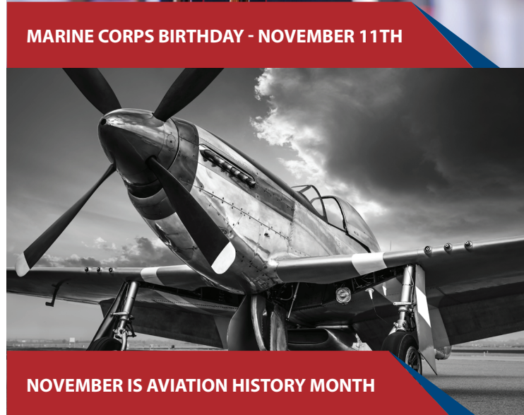
NOVEMBER IS AVIATION HISTORY MONTH