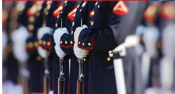
MARINE CORPS BIRTHDAY - NOVEMBER 11TH