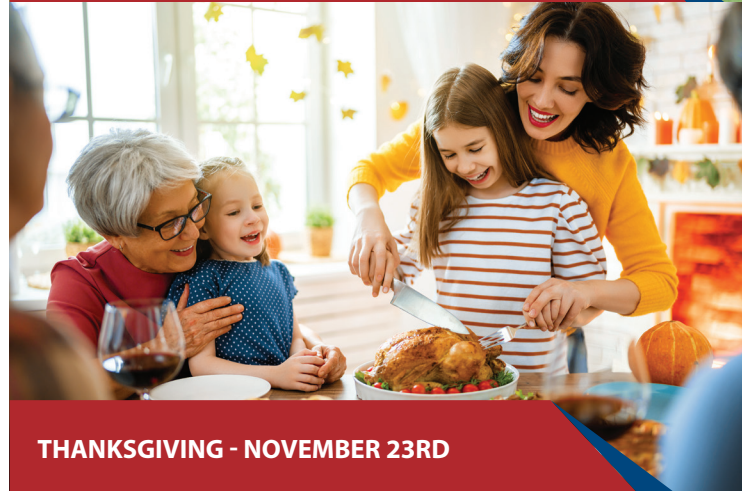
THANKSGIVING - NOVEMBER 23RD