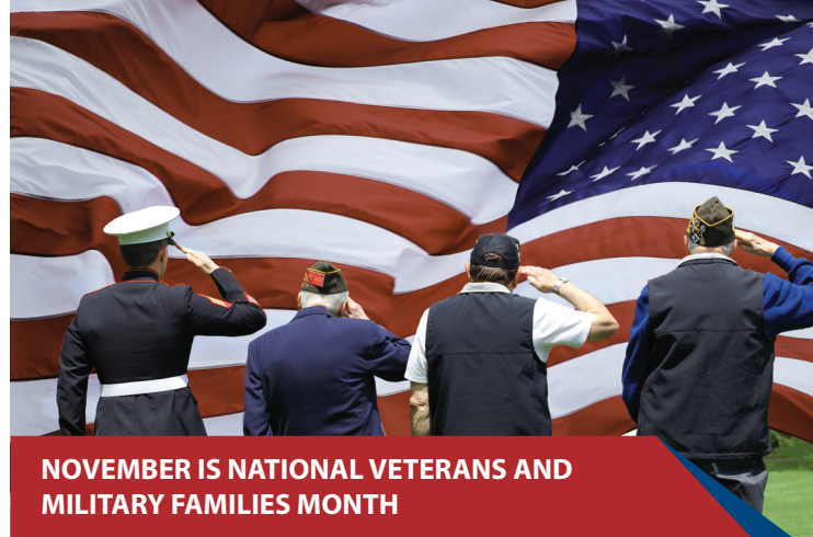
NOVEMBER IS NATIONAL VETERANS AND MILITARY FAMILIES MONTH

Office Hours: Monday, Tuesday, Thursday, & Friday - 8:00 AM – 5:00 PM Wednesday - 9:00 AM – 5:00 PM